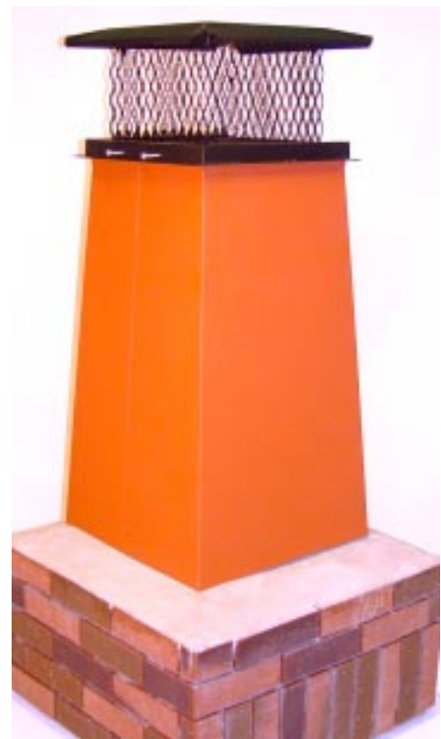
Model T (Tapered)

The Model T provides an easy way to extend your chimney and allows installation of any standard chimney cap or damper cap on top. It provides a distinct tapered look which complements any chimney. It features a 4-piece stainless steel interior liner with our unique expansion system. This liner extends down into the existing chimney and provides a safe attachment.